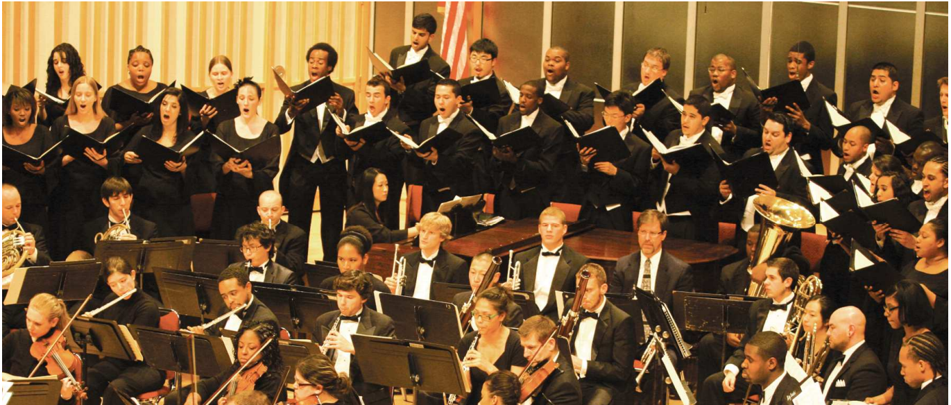
The Washington Adventist University choir and orchestra in a recent performance