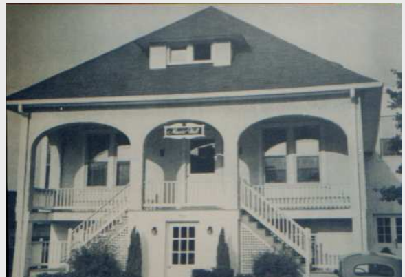
The Music Hall

This arrangement continued for two decades, until a Music Studio Annex became the building for music, with the choir rehearsing in nearby Sligo church, finished three years earlier, in 1944. The Annex, later called the Music Hall, has been in use for more than 60 years. It, with a former residence now known as the Music Annex, an atrium in Sligo church, and a wing of the men's dormitory house the music program.